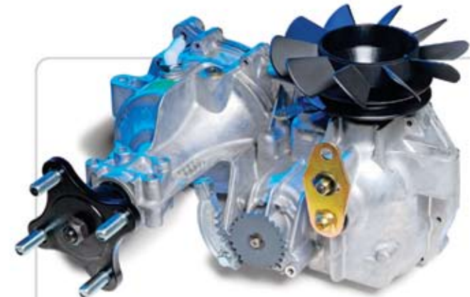
The maintenance-free EZT transmissions are the heart and soul of the Mini FasTrak's SmoothTrak™ steering